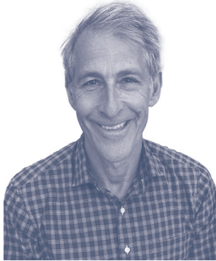
MICHAEL M. LYNTON