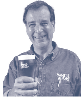
C. JAMES KOCH